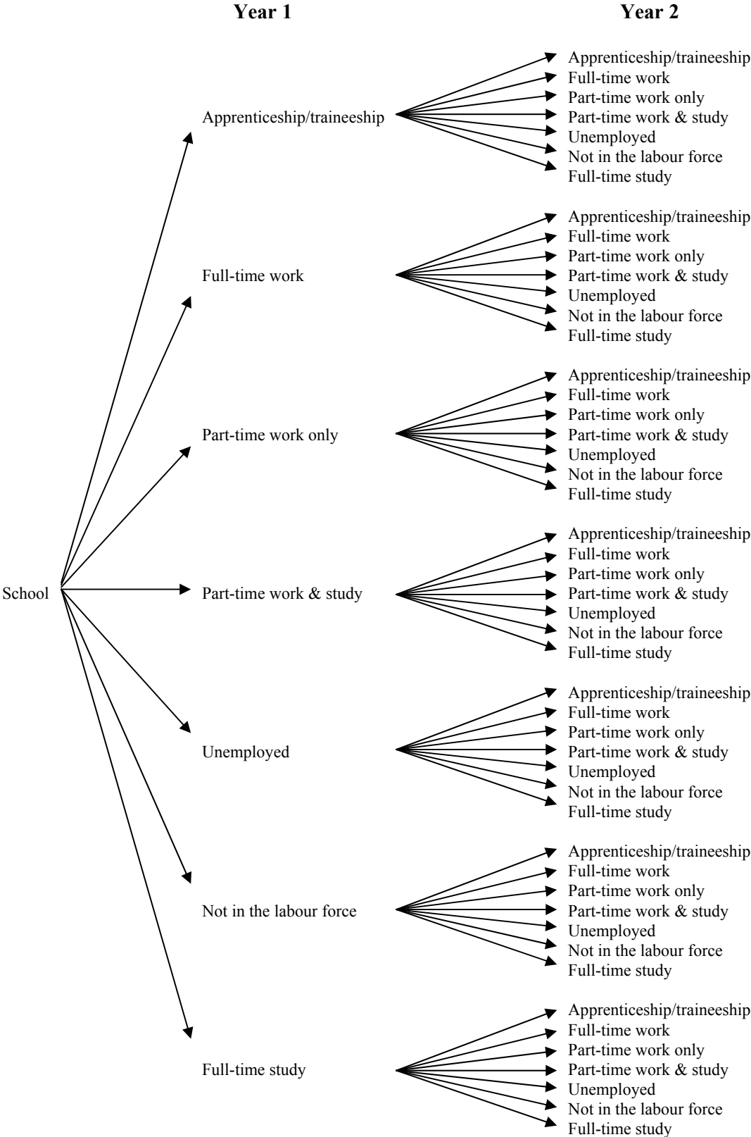
Figure 1 Illustrative model of the possible patterns of combined activities over the first two post-school years