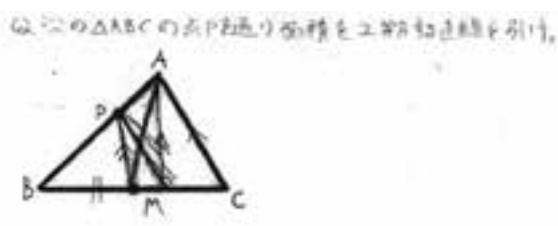
Figure 3b Kawa's work

In Figures 3a and 3b, we can see the problem representations constructed by each student. Such representations have their own role in the learning and problem-solving process and warrant specific investigation. Such dyadic interaction is a social performance with the purpose of completing a given mathematical task or problem. The nature of student cognition during such interaction warrants much closer study for several reasons: