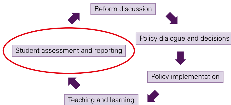
Figure 1 The education reform cycle